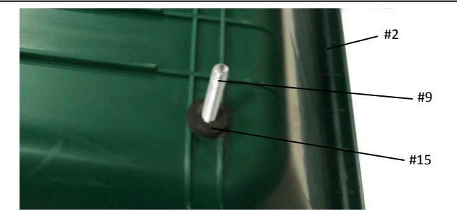
Step 4: Place the Poly Tray (#2) upside down and insert Tray Bolts (#9) through the 4 holes in the bottom of tray from the inside sliding Rubber Washers (#15) over the Tray Bolts (#9) on the outside of tray to hold in place.